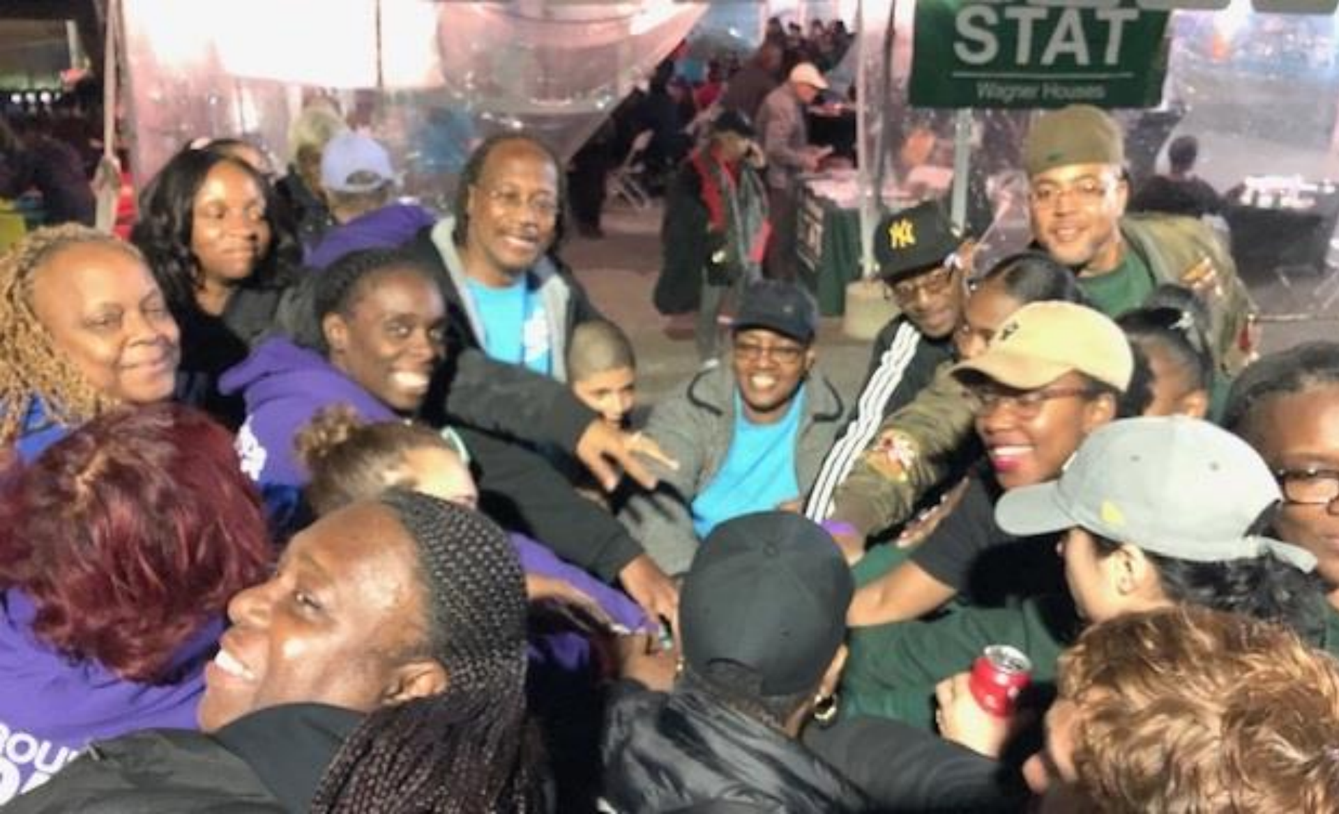
Resident stakeholders from MAP developments at a recent NeighborhoodStat