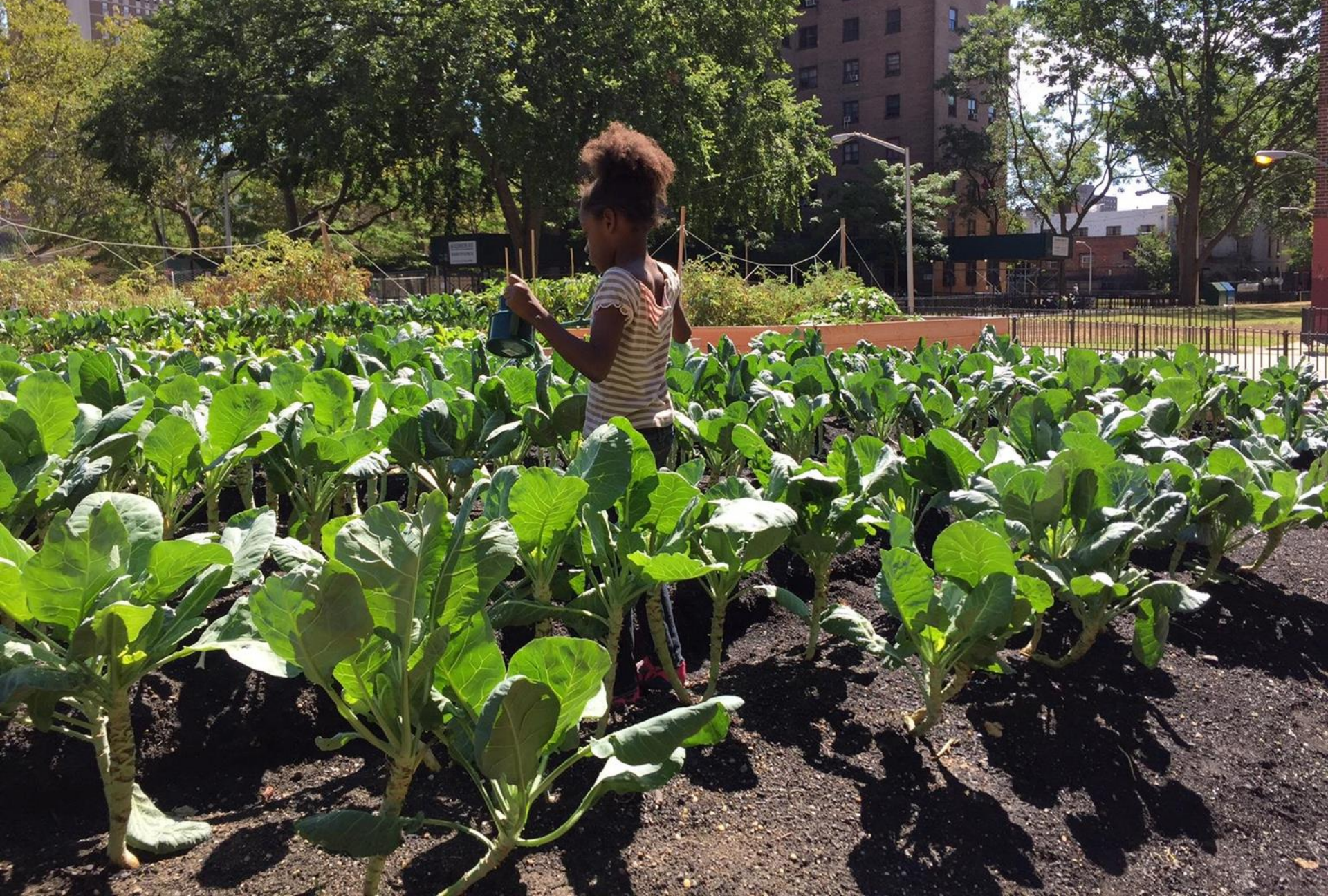
Howard Houses Farm in Brownsville