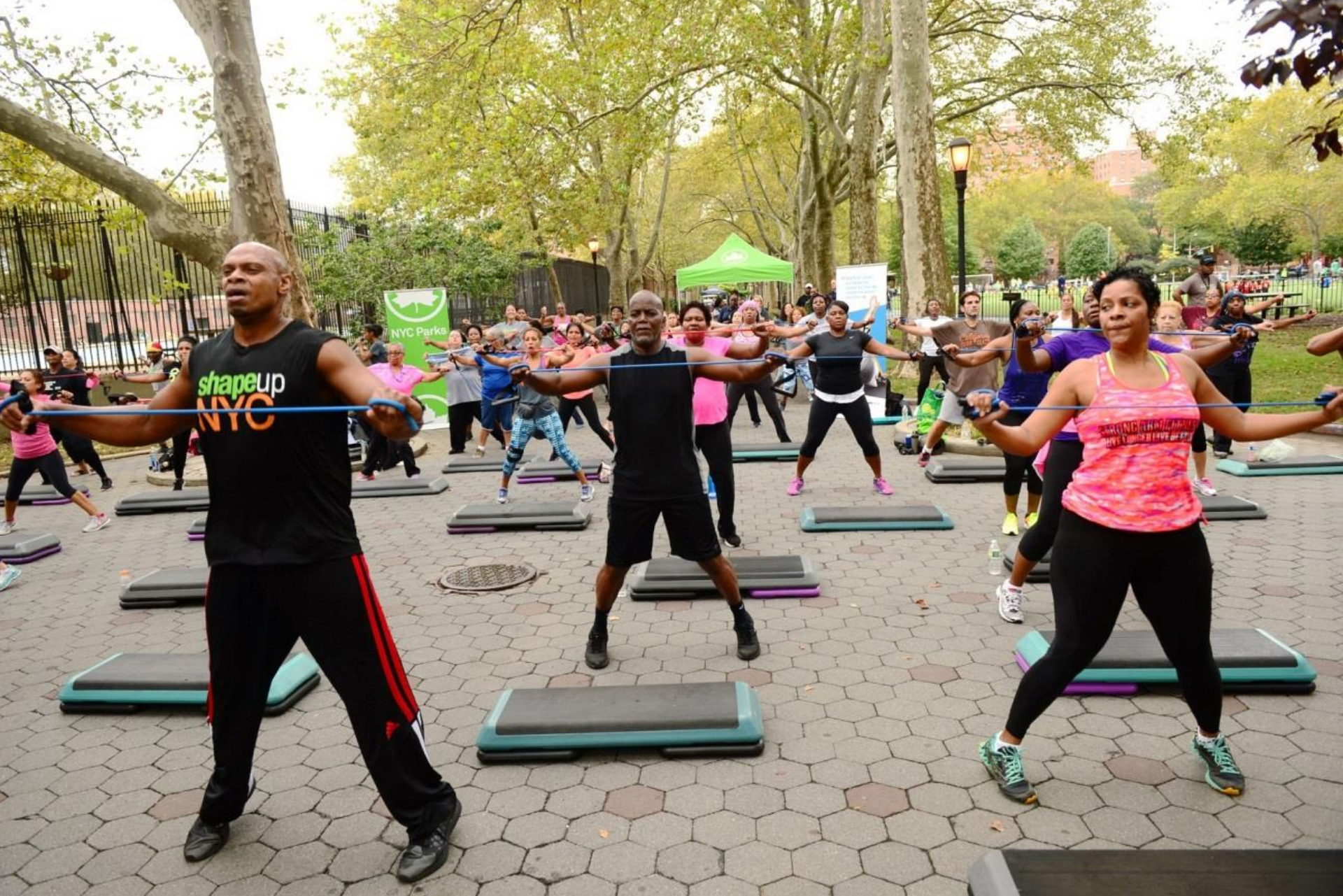
Shape Up NYC celebration in Thomas Jefferson Park in East Harlem